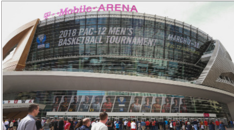
► T-Mobile Arena, Las Vegas, Nevada Host site of the 2023 Pac-12 Men's Basketball Tournament