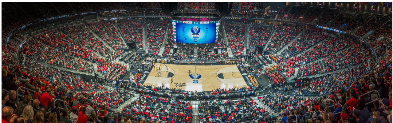
► In its first year at T-Mobile Arena in 2017, the event set records for highest-attended quarterfinal session (18,153, Session 4), highest-ever single-session attendance (19,224, Session 5), and total all-session attendance (86,910).