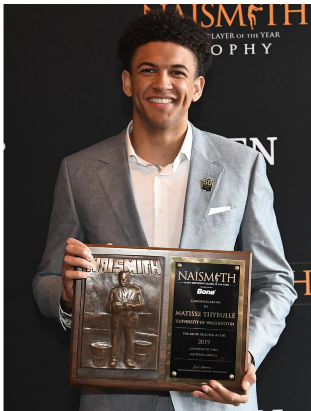
Matisse Thybulle, WASHINGTON Pac-12 & NCAA Steals Leader - 3.5 spg