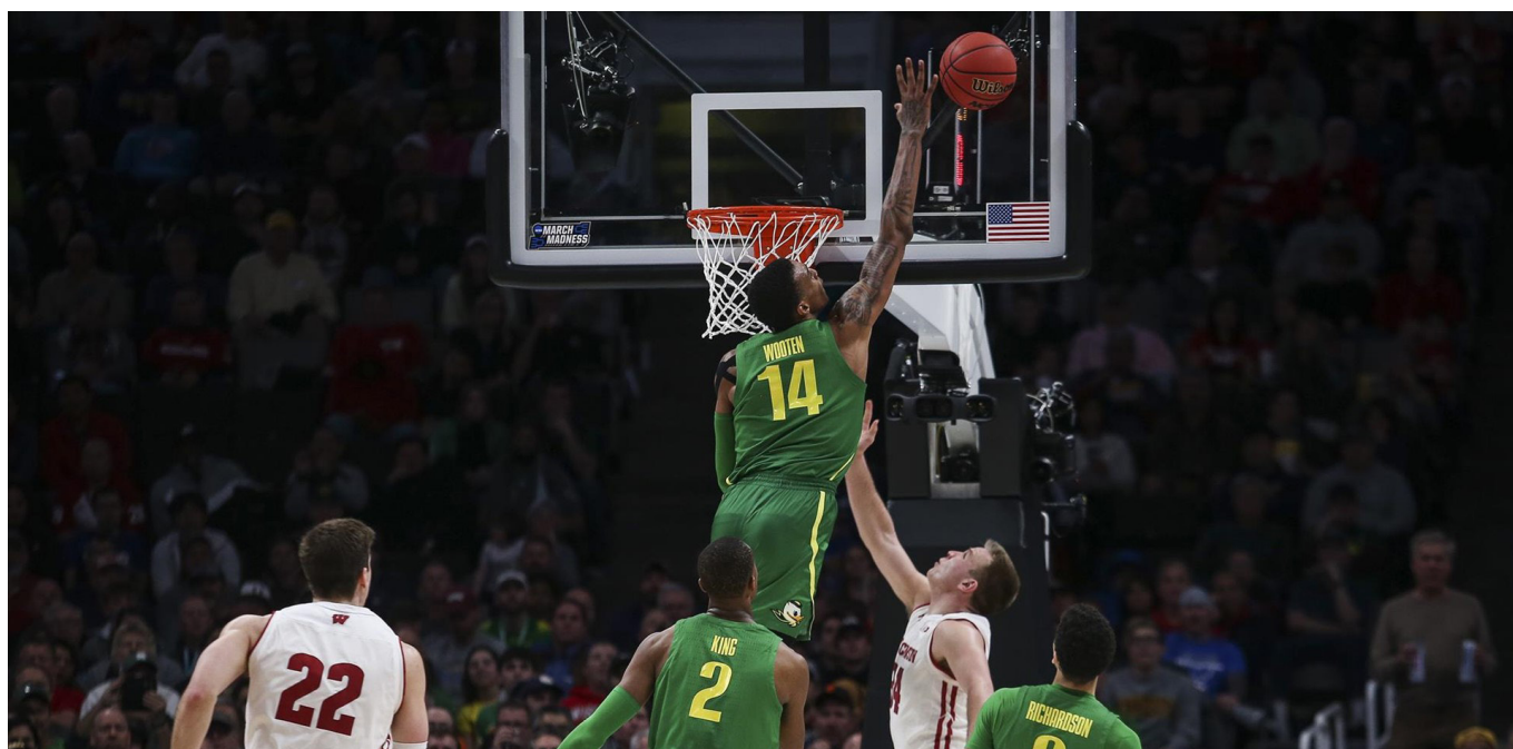
OREGON's Kenny Wooten was a breakout star in the 2019 NCAA Tournament, averaging 7.3 points on 71 percent shooting, 6.3 rebounds and 4.0 blocks in helping the Ducks reach the Sweet 16 for the third time in the past four seasons.

#2 Texas 68, #4 COLORADO 55 (Austin, Texas)